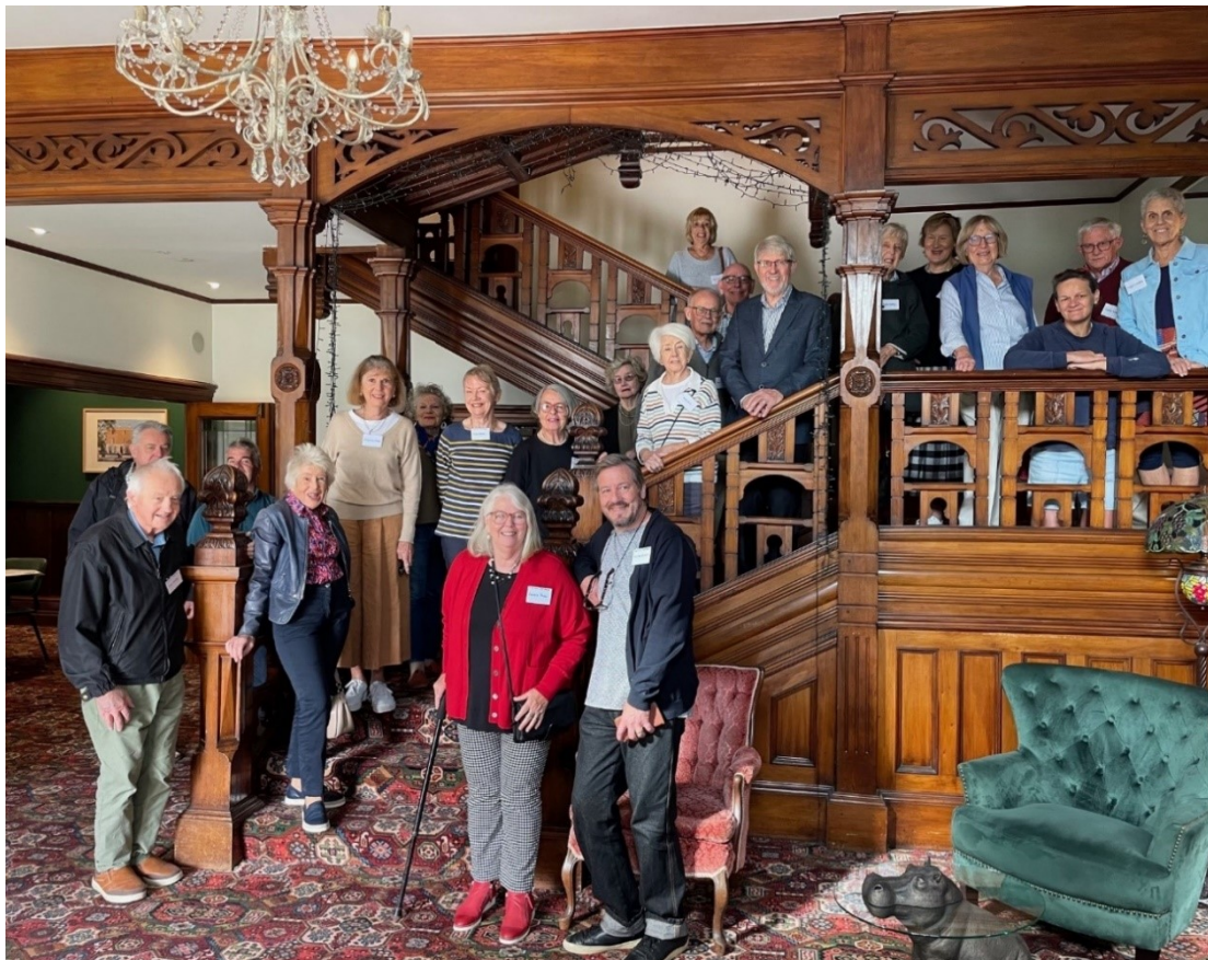
Civic Trust members during their visit to Brookfield House