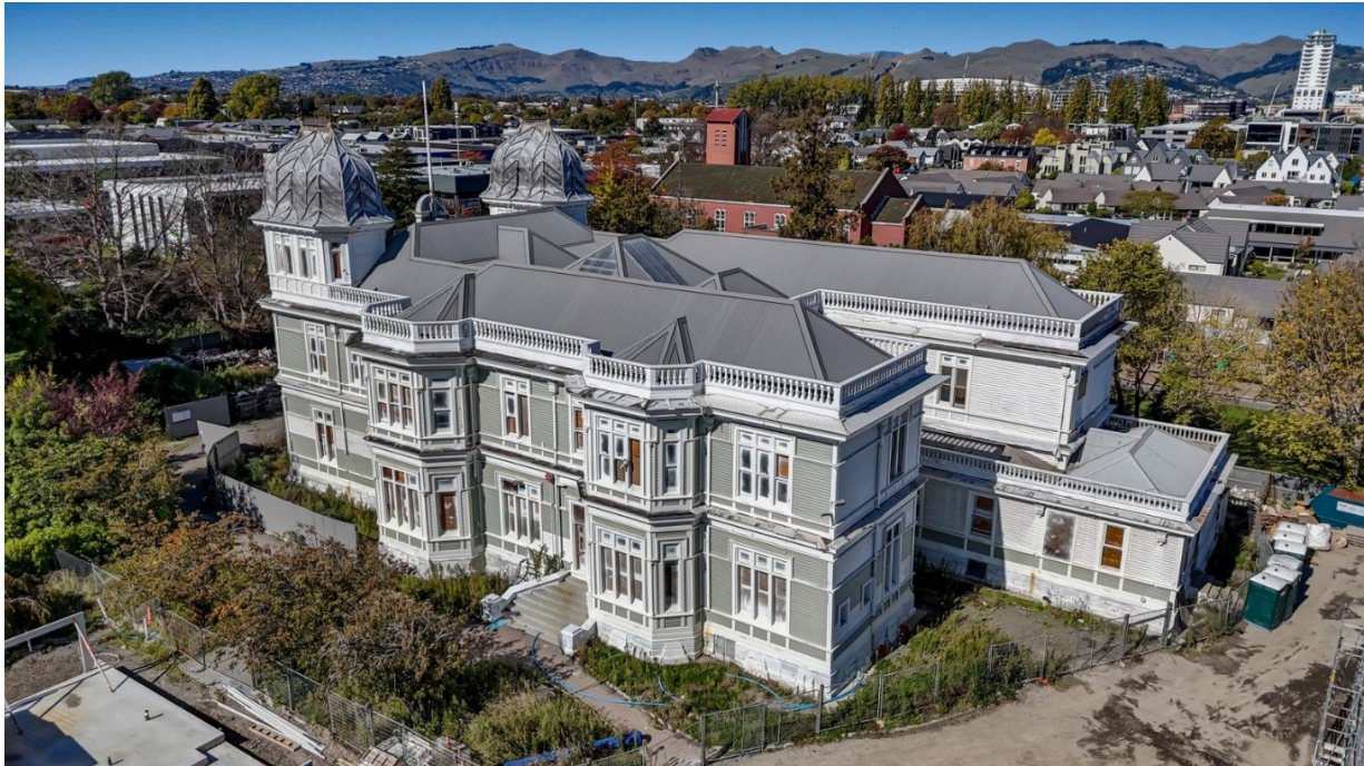
Aerial View of the exterior of McLean's Mansion