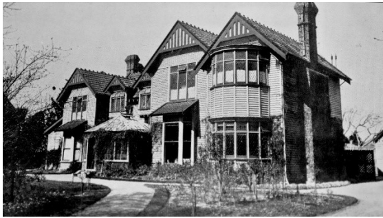
Brooksfield House c1930