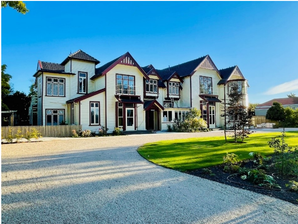
Brooksfield House 2025