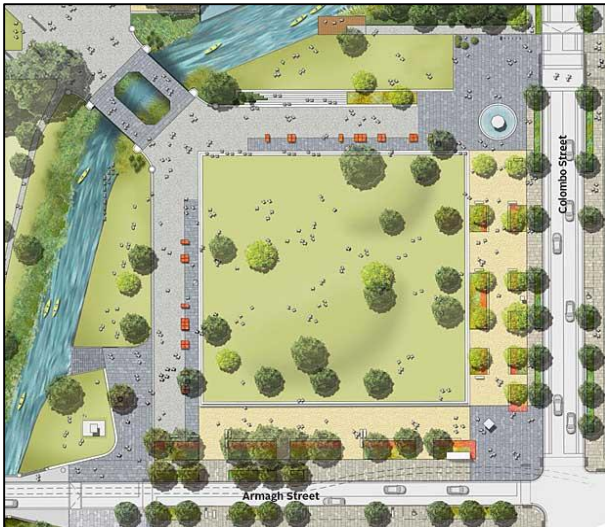
Proposed design for Victoria Square

Without doubt, the quoted cost of around $7million in taxpayer money to modify Victoria Square from the intact and much loved space that it is, to meet the vision of a few planners and dreamers, is beyond comprehension for the majority of Christchurch citizens. It is, in the eyes of those with sympathy for displaced red zone people and those still awaiting financial settlements, a travesty of justice to allocate such money to an unnecessary project, when other vital civic facilities are needed to replace those lost in the earthquakes.